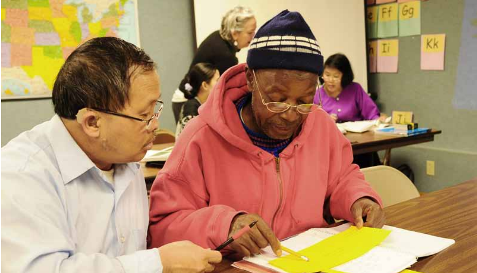
Two adult learners from International Learning Center in Milwaukee work together during class. International Learning Center is one of 62 Wisconsin Literacy member agencies, where adults receive direct services to improve their reading, writing and English language skills.